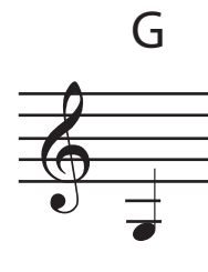
Sixth String Third Fret (Third Finger)

# "Sharp" or "up one half step" on guitar means one fret higher