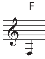
Sixth String First Fret (First finger)