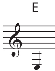
Sixth String Open String